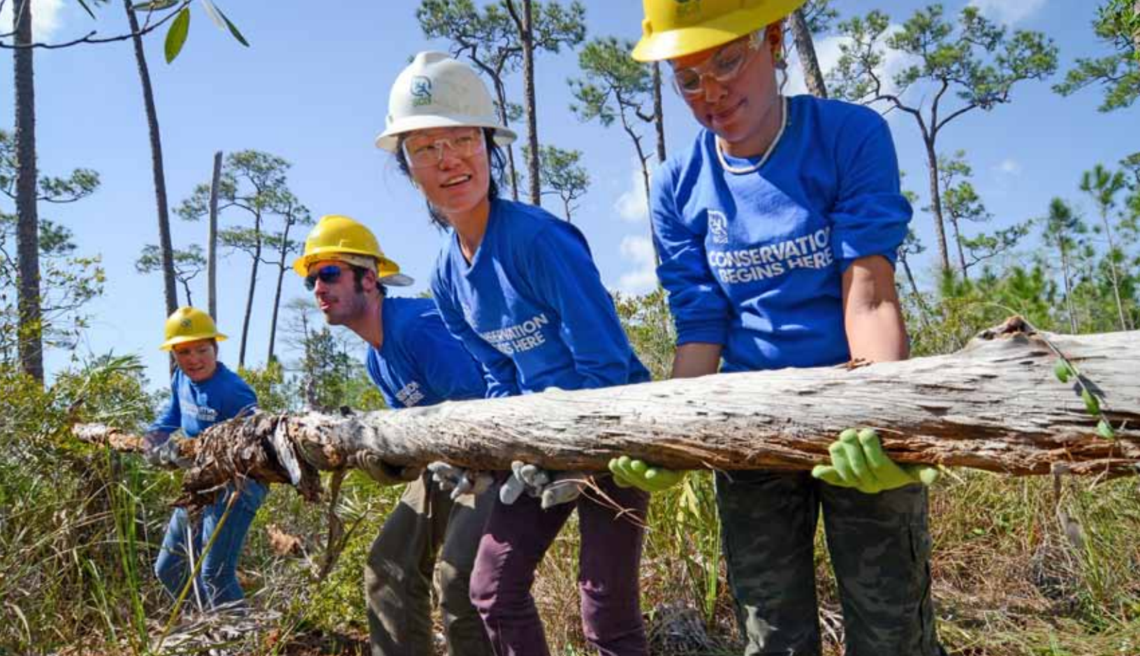
Members of the Student Conservation Association (SCA) clear brush away from marked trees, in an attempt to reduce summer wildfires at Big Cypress National Preserve.