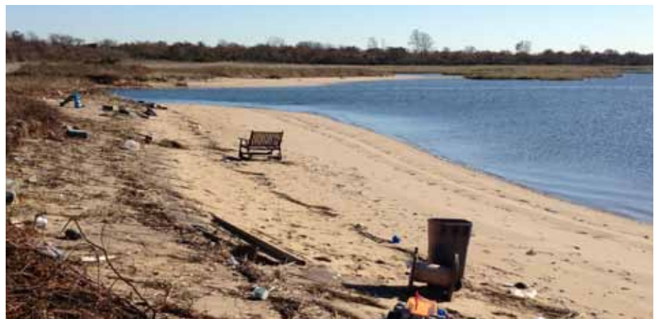
Debris along Black Bank Beach at Jamaica Bay Wildlife Refuge.

Follow the progress of SCA's Sandy recovery program at thesca.org/sandy .