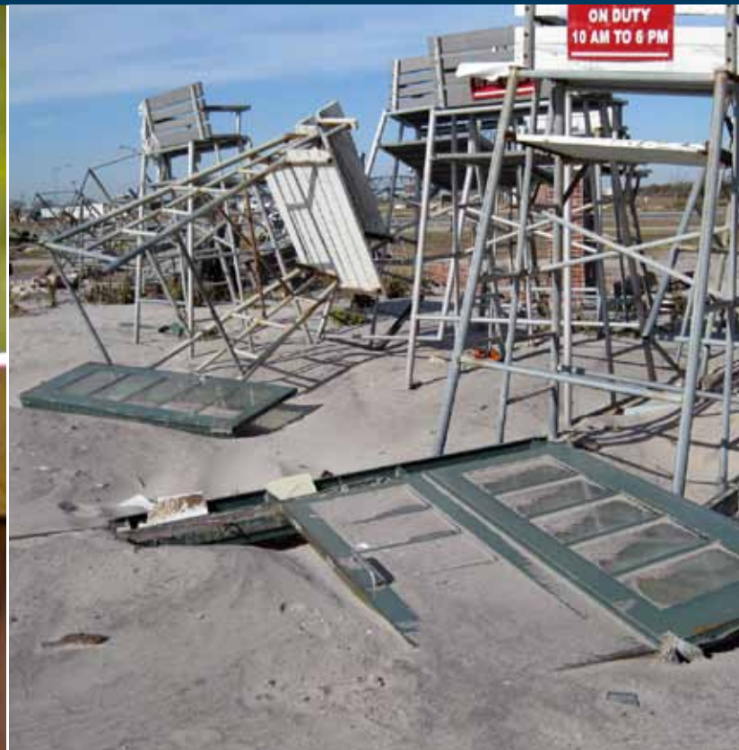
SCA crews will help to rebuild New York-New Jersey parks damaged by Hurricane Sandy after removing debris and sand deposited by the storm. Right: Jacob Riis Park, Gateway National Recreation Area, courtesy of Pisan/NPS.