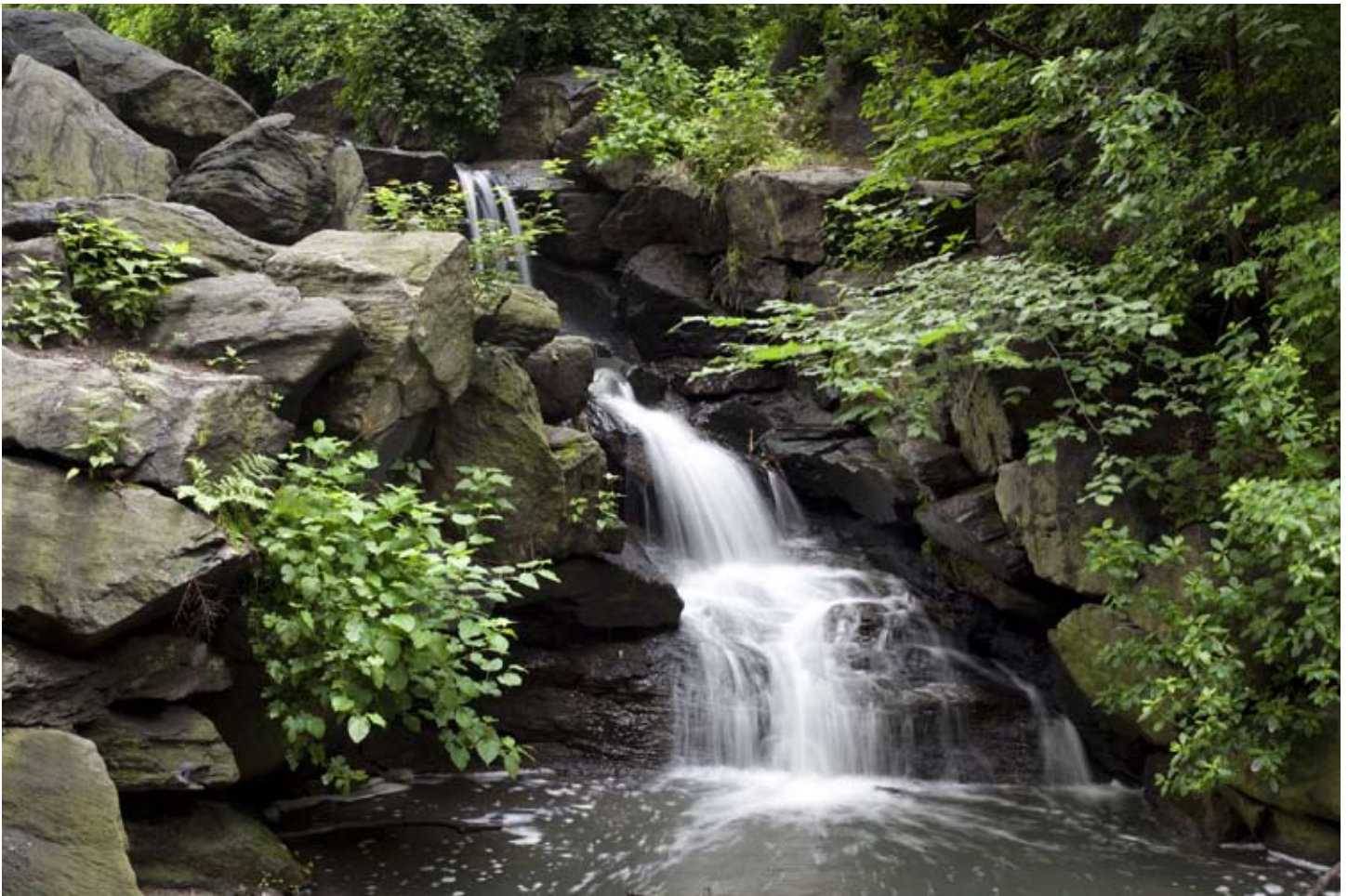
North Woods waterfall in Central Park, New York City