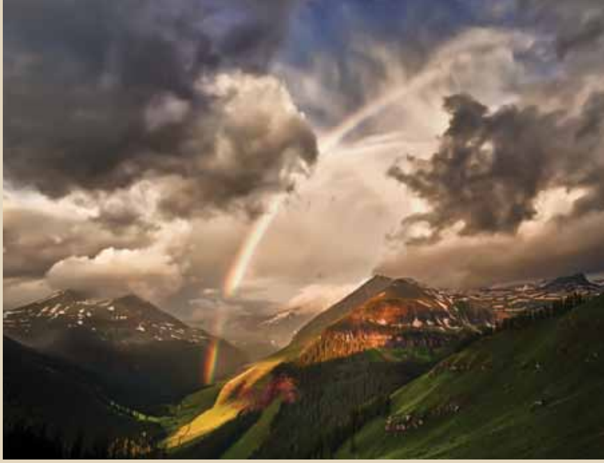
Silverton Mountain, CO. "On the way to Clear Lake."

For more information, visit: thesca.org/GCAscholarship